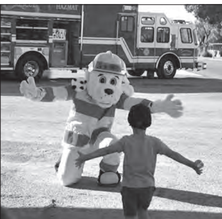
Sparky the Fire Dog and McGruff the Crime Dog both mingled with event goers. The morning time event fostered community togetherness and emphasized YPG's commitment to the well-being of its Soldiers and their Families.