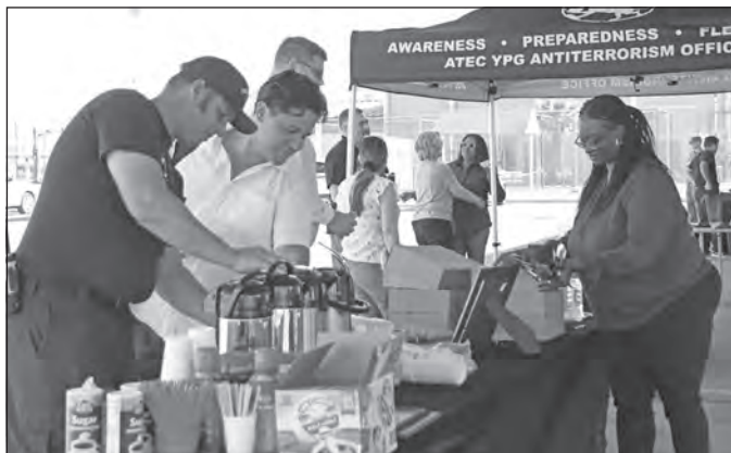
On April 30, 2024, Yuma Proving Ground (YPG) hosted the fourth annual S.A.F.E. Coffee Drive-Thru event. The initiative aimed to show the resources available on post for YPG Soldiers and their Families.

a chance to interact with people from offices like Army Community Service, the post chapel, and health clinic.