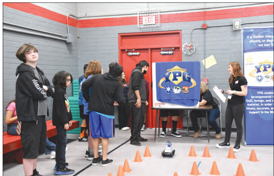
Students at Woodard Jr. High School's had the opportunity to learn about science, technology, engineering, and mathematics also known as STEM from members of Yuma Proving Ground's workforce and other local organizations and businesses. The school hosted a STEM Day for nearly 600 students.