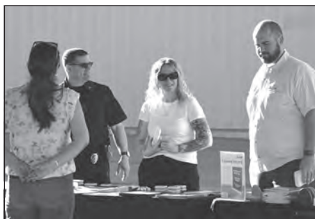
The S.A.F.E. Coffee Drive-Thru event featured table displays which provided free books and brochures. Representatives from various helping agencies on post mingled with the attendees including the Health Clinic which provided flu shots, promoting preventative care.

if someone is having any concerns about suicide. If they even have one little thought, we want to make sure we are addressing it and providing support."