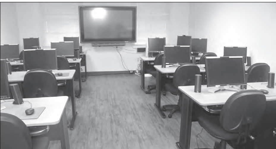
The Army Education Center initiated new operating procedures, including heightened disinfection of our computer stations, office equipment, and shelves in the Multi-Use Learning Facility and the Army Personnel Testing office. Disinfecting wipes will also be provided upon your prior to and/or at the conclusion of use.