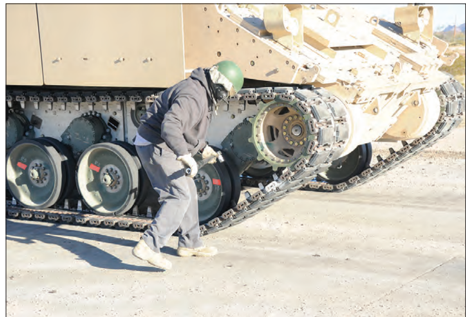
During performance testing, the evaluators collect roughly 100 channels of data, including the displacement and temperature of each road arm as they are put through their paces.

pressure, so the vehicle is less prone to getting stuck in soft soil.”