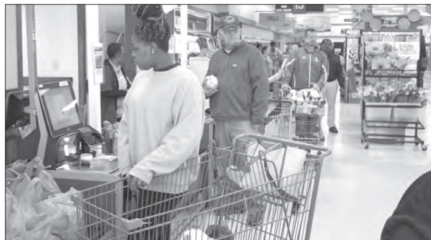
To prevent customer-to-customer spread of germs, commissary cashiers no longer handle patron ID cards. Instead, customers will be asked to scan their own ID. Cashiers can use the handheld scanner if available or have the customer scan their own card. Where available shoppers will use the self-checkout lanes.