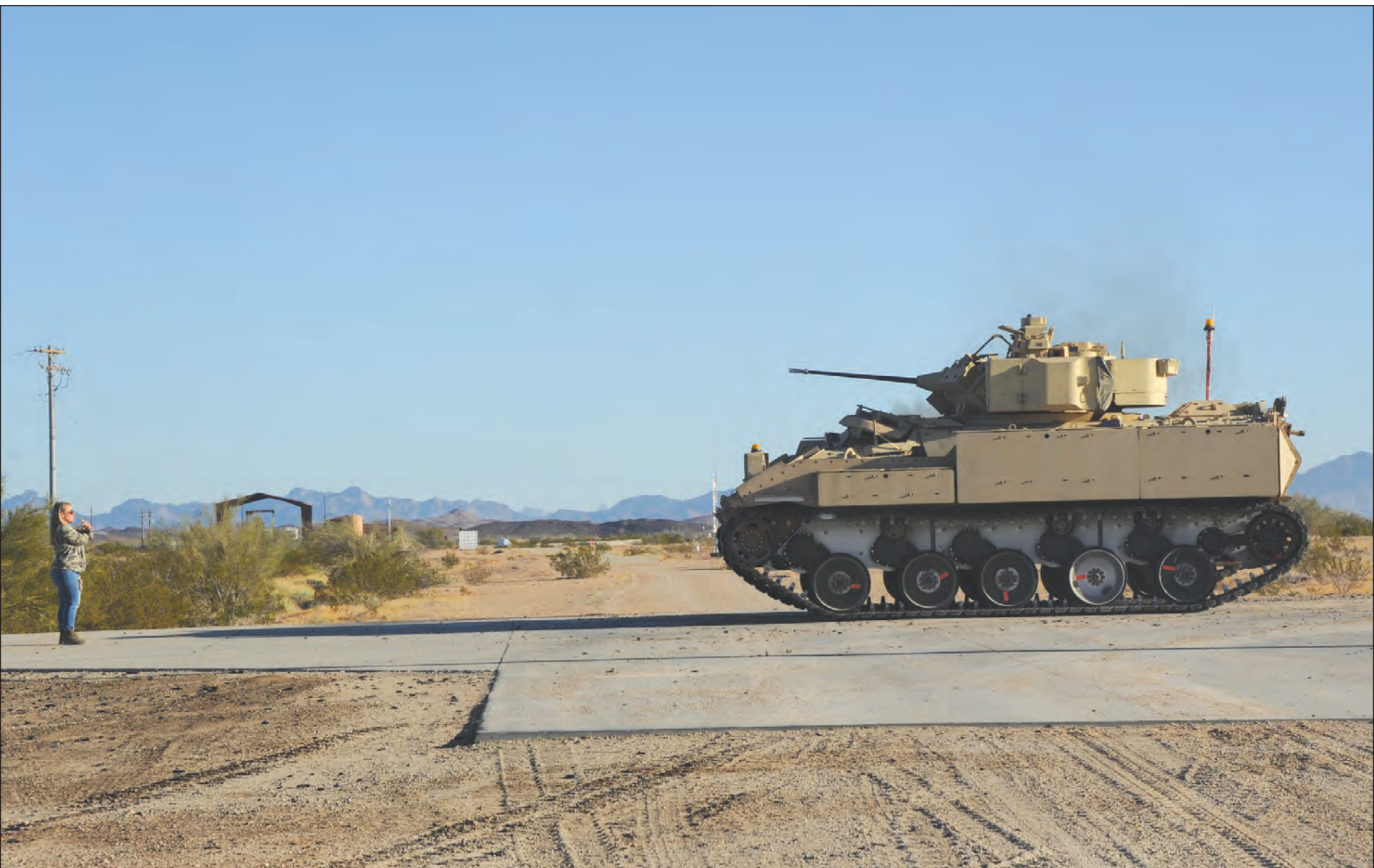
YPG has been testing the Ground Vehicle Systems Centers Advanced Running Gear for potential use on the future NGCV Operationally Manned Fighting Vehicle. The ARG system is using an existing Bradley Fighting Vehicle as a surrogate test platform.