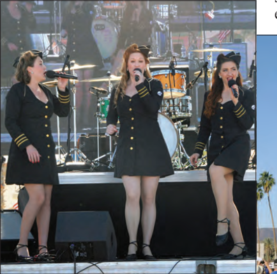
ABOVE: The Manhattan Dolls are returning to the stage at the YPG 2020 celebration and open house. LEFT: The Military Free Fall School will play an important role at the celebration. They will support by jumping in the flag during the opening ceremony at the YPG 2020. They were a crowd favorite during YPG's 75th anniversary celebration.