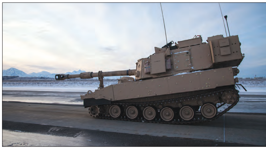
U.S. Army Cold Regions Test Center is the Department of Defense's lone extreme cold test facility. Among other platforms, the test center has conducted rigorous tests of the Stryker combat vehicle and M109A7 Paladin self-propelled howitzer, pictured here coming to an abrupt stop.

Among other platforms, the test center has conducted rigorous tests of the Stryker combat vehicle and M109A7 Paladin self-propelled howitzer, both of which utilized CRTC's Mobility Test Complex as part of their testing. Concurrent with this military testing, the track accommodates multiple customers from private industry, something it has done since its inception in 2004.