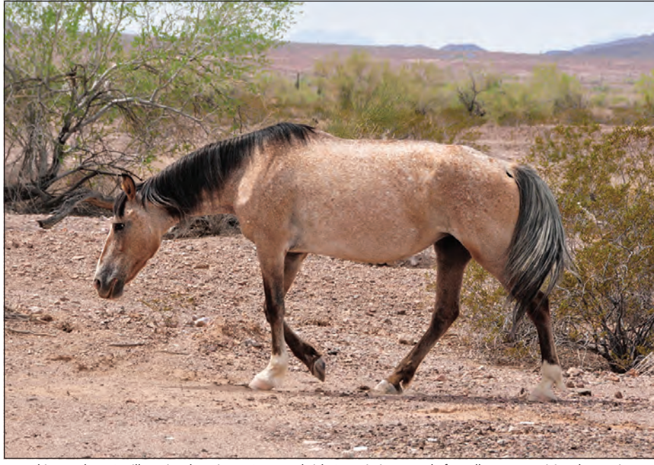
Later this month, YPG will receive the Arizona Game and Fish Commission Award of Excellence recognizing the proving ground's efforts in wildlife and natural resource conservation. The proving ground is home to a wide array of wildlife, from desert tortoises, wild horses, to one of Arizona's healthiest and most genetically-diverse populations of bighorn sheep.