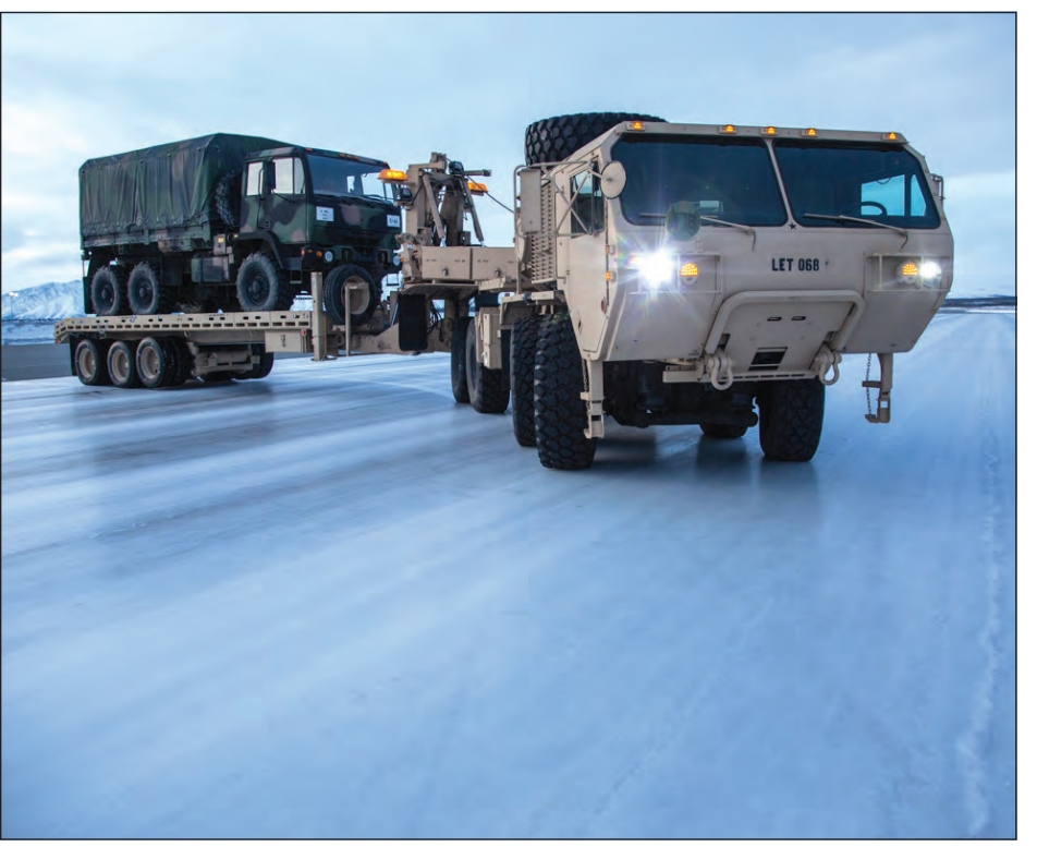
The track, three and a quarter miles long, can accommodate as many as 35 vehicles simultaneously, though typically there are no more than 20-25 at a given time.