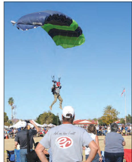
The Military Freefall School will play an important role at the celebration, jumping in the flag during the opening ceremony.