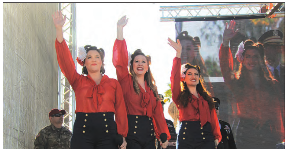
The Manhattan Dolls are returning to the stage at the YPG 2020 celebration.

FMWR has not settled on a local band for the mid-afternoon show, but will bring back the crowd-pleasing