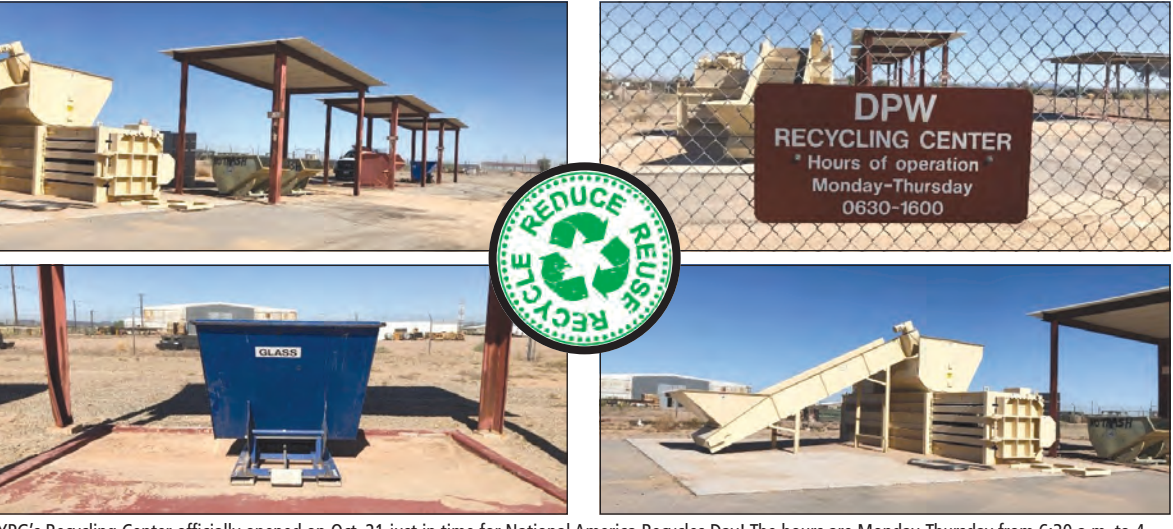
YPG's Recycling Center officially opened on Oct. 21 just in time for National America Recycles Day! The hours are Monday-Thursday from 6:30 a.m. to 4 p.m. The facility is located in the Walker Cantonment area off Sanchez street east of Building 2660. Accepted items are cardboard, aluminum, plastic, glass and wood pallets.