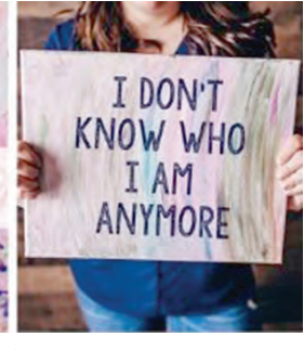
FIND YOUR PASSION AND PURPOSE