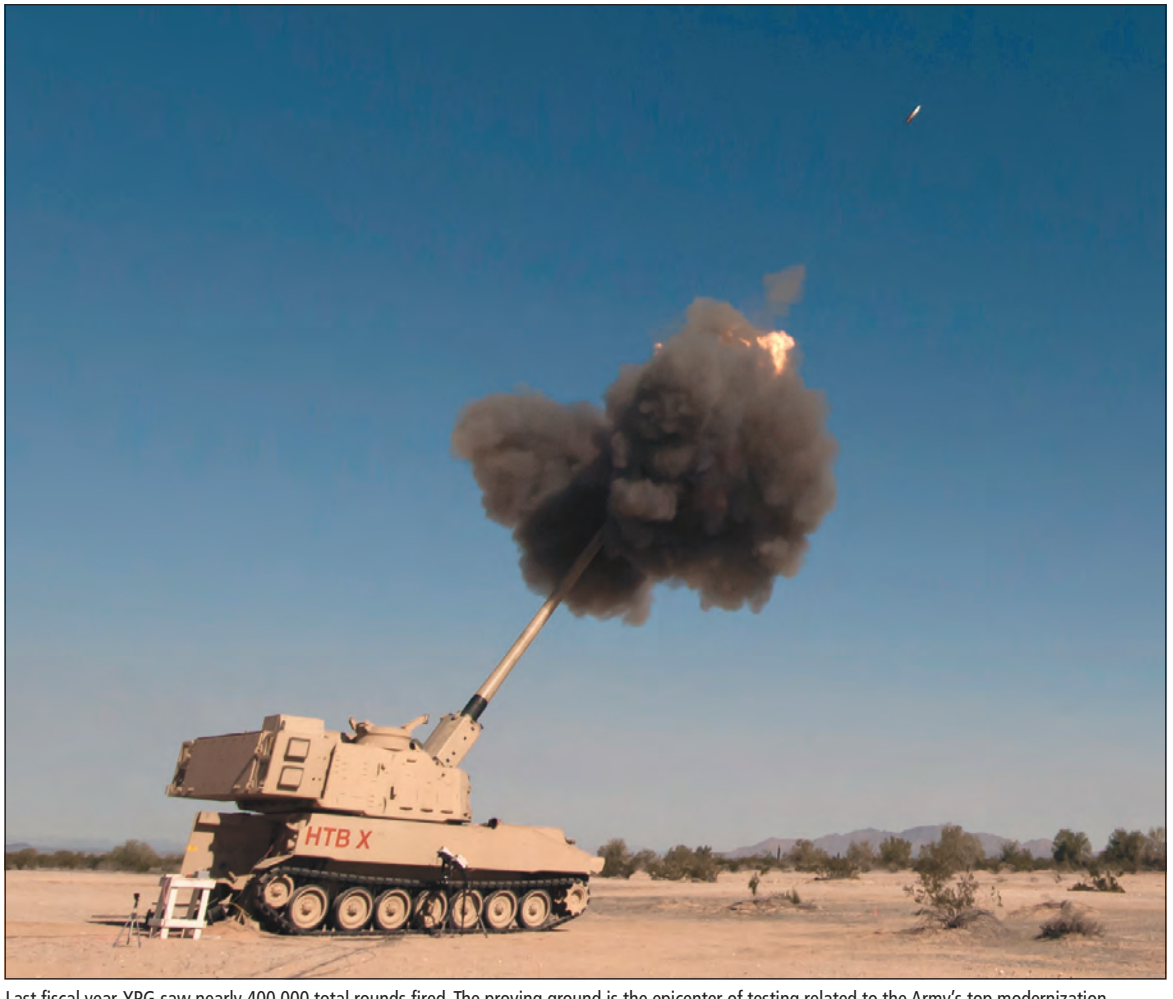
Last fiscal year, YPG saw nearly 400,000 total rounds fired. The proving ground is the epicenter of testing related to the Army's top modernization priority: long range precision fires. The Extended Range Cannon Artillery shown in this photo is just one of the many tests conducted at YPG.

Whatever time of day they occur, YPG's isolation and natural terrain bowl of mountains surrounding it on