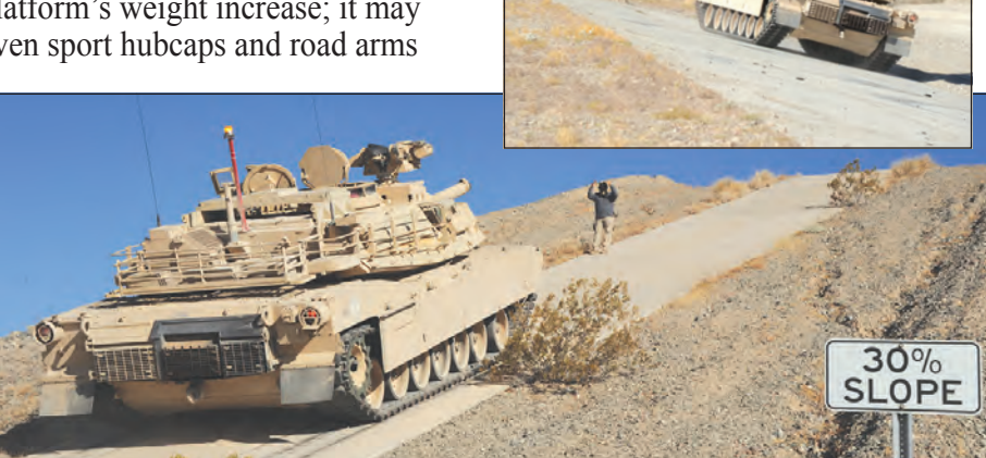
These photographs demonstrate examples of slope testing, "We put it in situations where the vehicle is on a slope that would cause all the fuel to settle on one end to see if the fuel pump can still pull fuel through the system and adequately restart it after sitting awhile," said Wilson. "We run side slopes in a sinusoidal pattern and check things like the fuel pump and brakes."

"The purpose of testing is to get it ready for combat," said Wilson. Ultimately it is going to end up in the warfighter's hands and we want it to be as perfect as it can be and perform flawlessly."