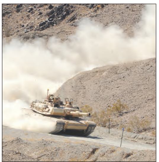
An M1 is pictured on one of YPG's many road courses, "We have multiple test courses here that simulate different types of roads we might encounter in different areas of the world," said Robert Wilson, test officer. "We test these vehicles' durability for thousands of miles across these various road surfaces."