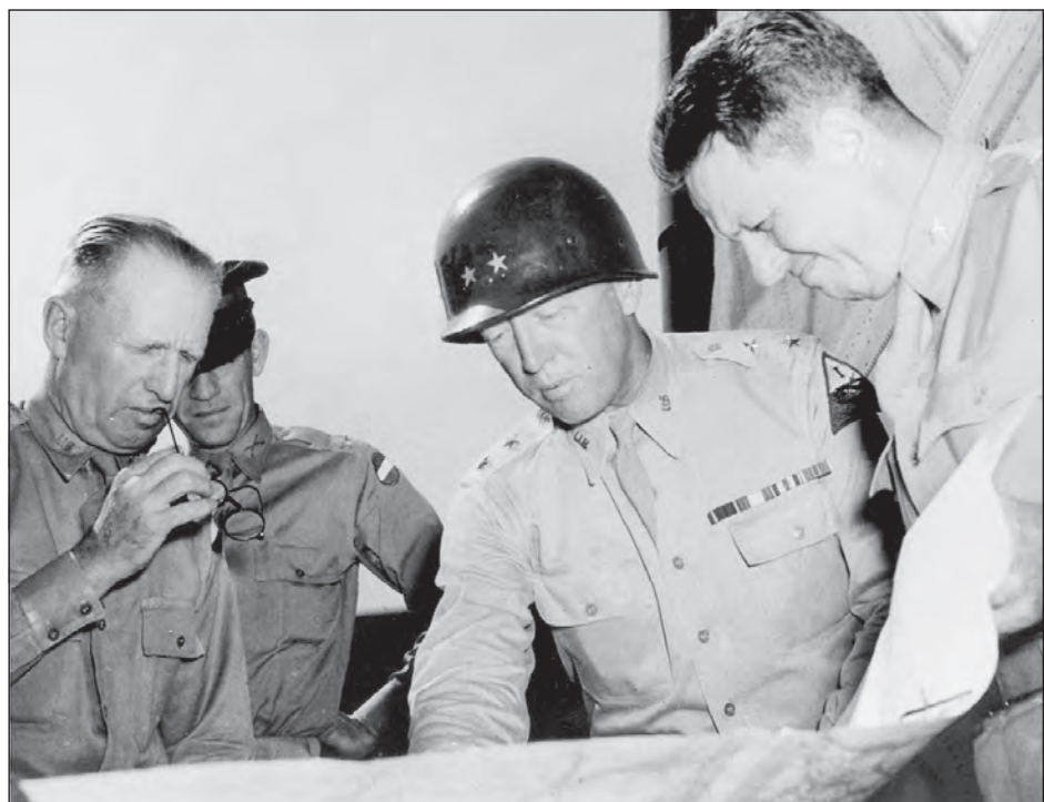
Then-Maj. Gen. George S. Patton established the California-Arizona Desert Maneuver Area which spanned Arizona, California, and Nevada. YPG is the last active Army installation in the Desert Maneuver Area.