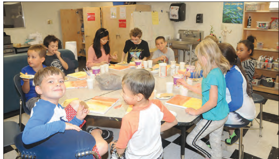
Students grab a quick snack before they prepare to paint a western themed piece of art.