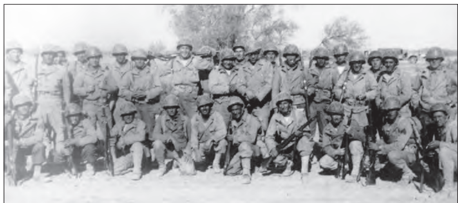
Yuma Proving Ground honors the men and women whose efforts at what is now YPG played a vital role in freeing Europe from Nazi tyranny during World War II.

YPG is the last active Army installation in the Desert Maneuver Area, and within its boundaries lies what once was Camp Laguna. Today, the camp's legacy lives on in a free Europe, not in architectural remains: all that is left on the desert floor are concrete pads, rock-lined pathways that were once flanked by hundreds of tents, and scattered detritus of camp life: badly rusted tin ration cans and cups, and the occasional glass Coke bottle.