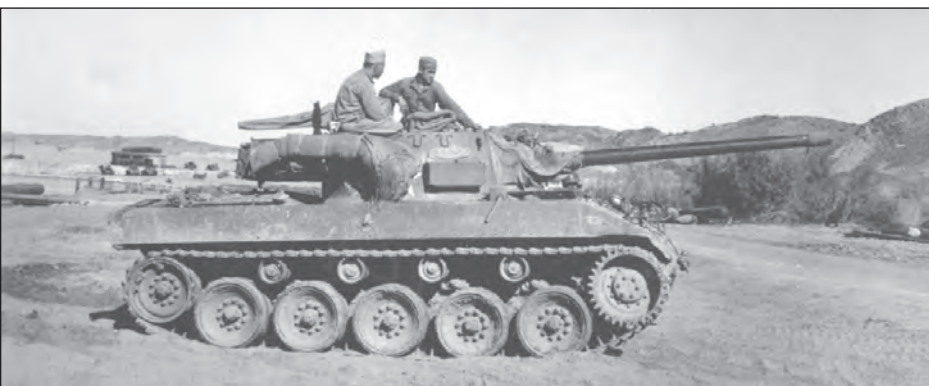
Of the 20 divisions of Soldiers that trained within the California-Arizona Desert Maneuver Area, seven participated in the Normandy Campaign, including the 8th and 79th Infantry Divisions who trained at Camp Laguna.