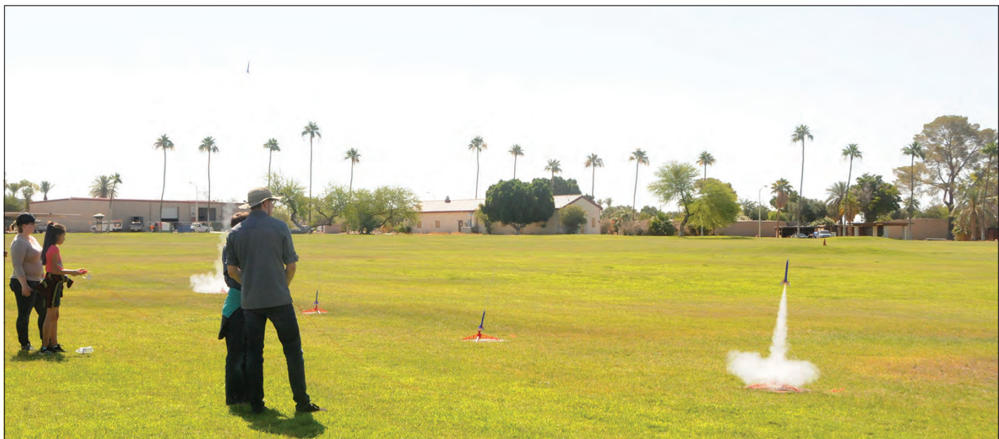
Up, up and away! GEMS students at YPG launched rockets from Cox Field early one morning as part of their STEM lab project.