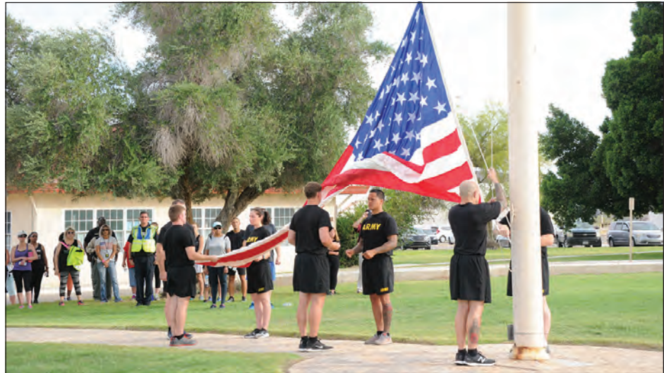
The YPG Color Guard made up from members of the Airborne Test Force conducted the Flag Raising ceremony.