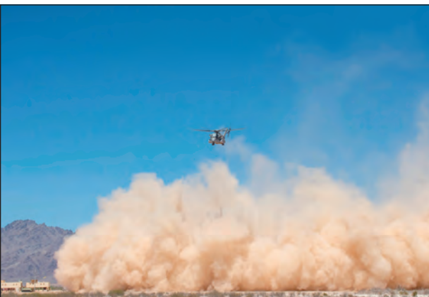
The degraded visual environment course at YPG is highly coveted by helicopter testers seeking to protect flight crews from the potentially catastrophic consequences of brownouts.