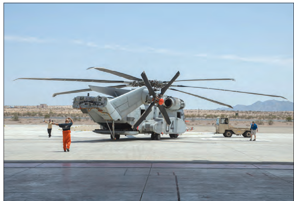
The CH-53 type helicopter has been a potent member of the Marine Corps aviation community’s fleet for over 40 years, and the ‘K’ version takes the platform to a whole new level. “It’s meant to be faster, stronger, lighter, and perform all the duties of the previous iteration with nearly triple the payload capability,” said Hi-Sing Silen, YPG test officer.

“We developed a very elaborate test methodology that is different from the typical test in brownout conditions,” said Silen. “We produced an independent link-to-link network from the airfield to the test site for their data acquisition instrumentation to operate from the airfield but talk to