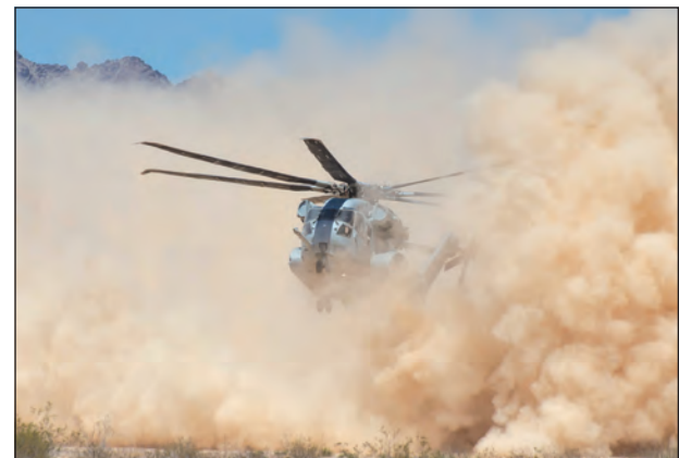
Hazardous in any situation, it is particularly risky when landing in a combat zone with multiple other aircraft.