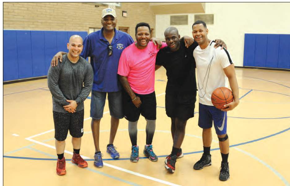
Team Air Delivery, back-to-back Org Day three-on-three basketball tournament champions!

Ground Combat had a five point lead, but not for long. The next three field goals were all by Air Delivery, including two three pointers, making it 31-28 Air Delivery. The Soldiers scored again before Ground Combat called for a time out, but it was no use. Air Delivery won round one