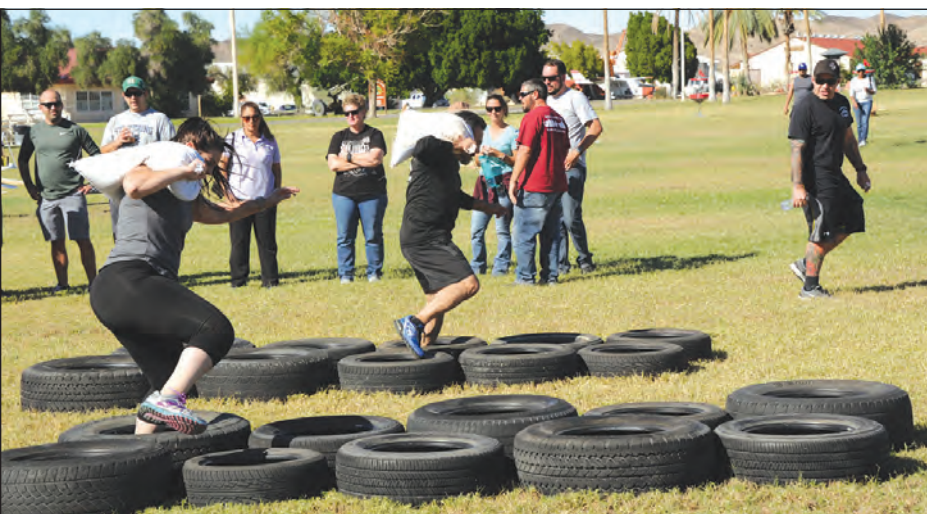
The sand bag buddy obstacle course was a challenging-- and competitive-- relay event.