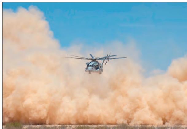
Caused by rapidly blowing sand and dirt thrown into a vortex by the rotor blades of a helicopter, a brownout’s swirling dust gives pilots the illusion they are moving even if they are hovering stationary.