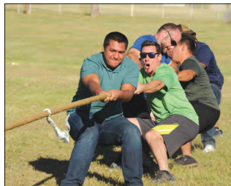
The Combat Automotive Systems Division continued their unbeatable dominance in the tug of war matches that ended the day.

Whether playing or watching, all who attended had fun, reacquainted with people in different divisions, and ate delicious food prepared by Family, Morale, Welfare, and Recreation.