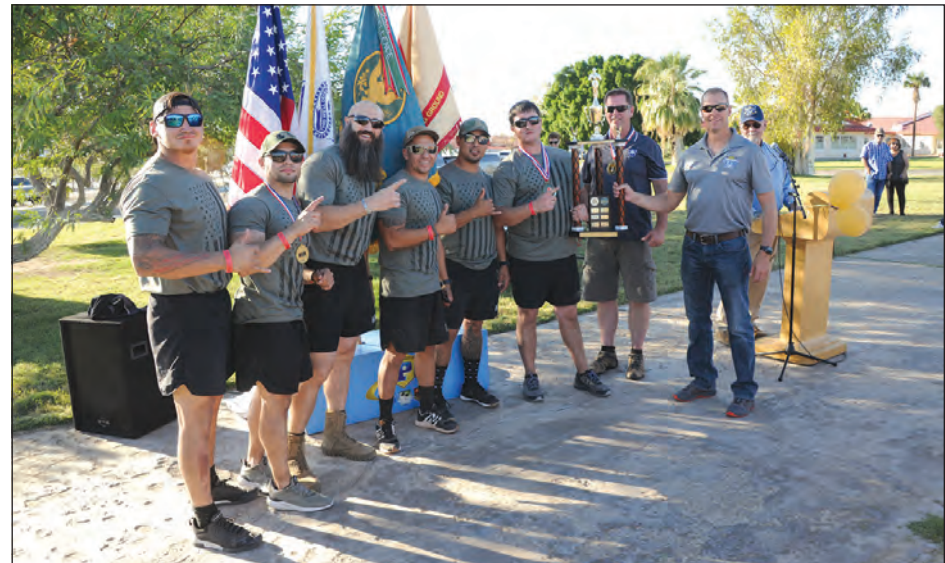
The Commo Cowboys unseated Team Air Delivery as Org Day champions. Congratulations, Commo Cowboys!