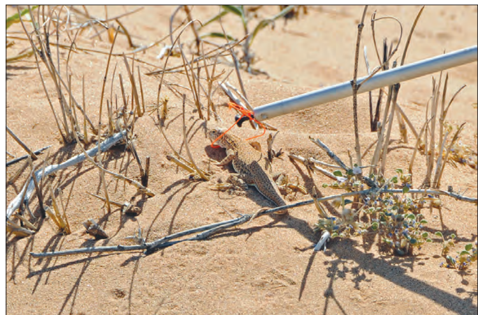
Blazingly fast in the sand and no more than four inches long, lassoing a Mojave Fringe-toed Lizard takes swiftness and dexterity.