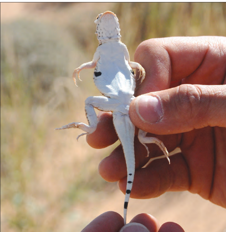
The oscillated tan coloration that heavily camouflages the Mojave Fringe-toed lizard in sand is only present on the creature's back. A crescent-shaped black dotted pattern on the throat is common, and some have similar dots on their chest or stomachs.