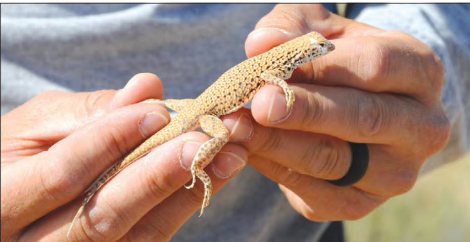
Mojave Fringe-toed lizards primarily eat ants and other desert bugs, and wait for their prey to pass by before striking. Scales over their eyes, nostrils, and ears protect them from sand.