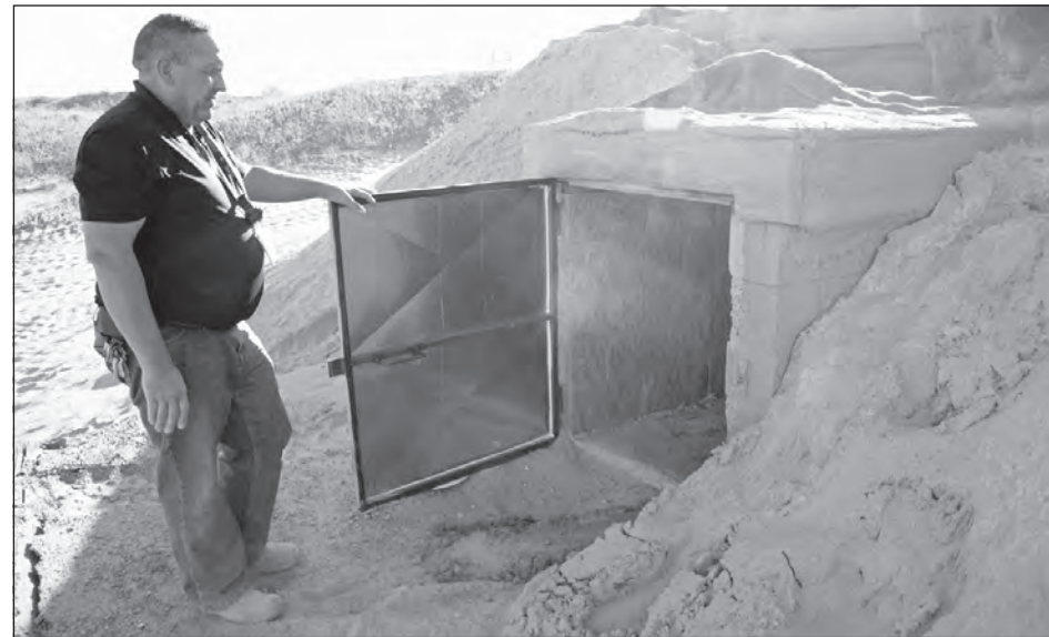
YPG's Support Services Division is constructing an isolated building concealed in rolling, hilly terrain as an addition to the installation's widely renowned K9 Village. Non-canine training units will have access to the site as well, as will testers in need of an additional location for sensor evaluations and other programs.

"It's kind of a funhouse effect—you think you are going somewhere, but you're not," said Arroyo. "When you are walking on your hands and