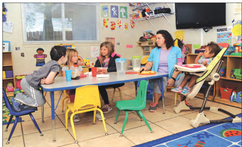
YPG's Child Development Center (CDC) also offers home-based daycare. Home-based daycare never has more than six children present at a given time, which some parents prefer to larger group environments.