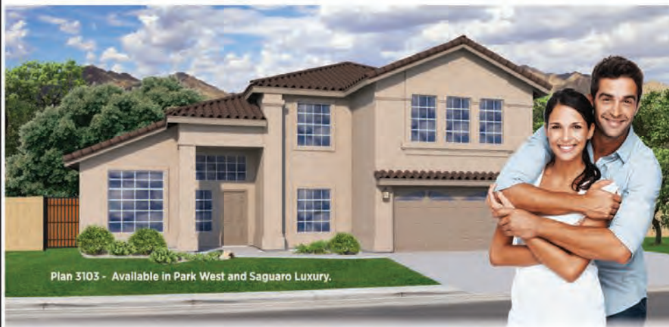
Plan 3103 - Available in Park West and Saguaro Luxury.

How will you spend your Tax Refund? How about a down payment?