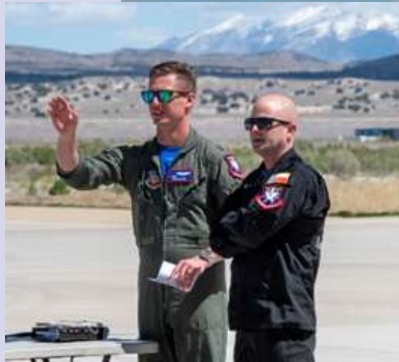
The F-35A Demonstration Team flying practice over Dugway Proving Ground benefited both the pilot and ground crew.