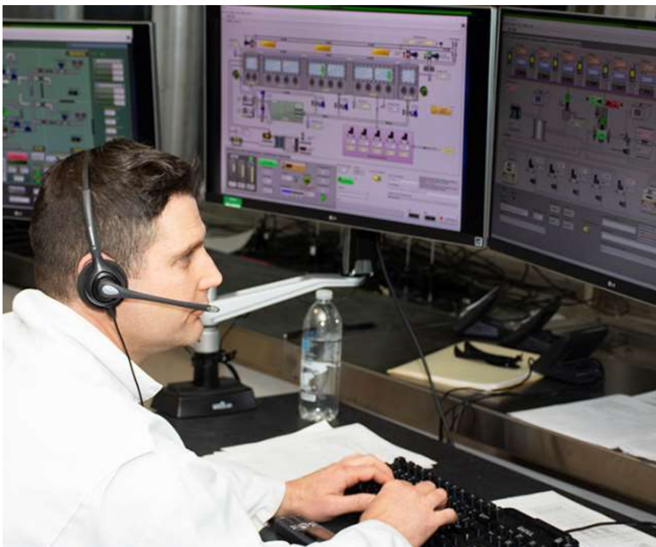
The Multi-Phase Chemical Agent Detector test employs four separate fixtures and chambers to challenge chemical agent detectors with chemical agent in four states: advanced threat vapor, liquid aerosol, particulate aerosol and chemical agent vapor. The goal is to determine which detector will become the Next Generation Chemical Detector for issue to all service branches.