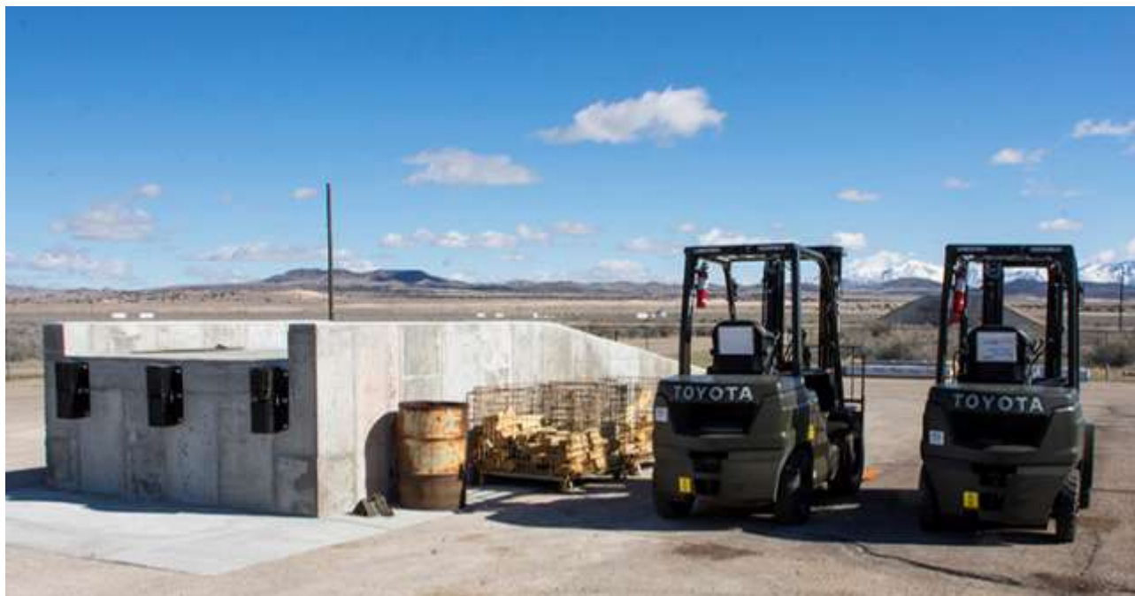
A new loading ramp and two new forklifts have replaced the aging metal ramp and old forklifts previously used for loading and unloading munitions at Dugway Proving Ground. A 20x34-foot steel building will also be constructed.

A Major Range and Test Facility, DPG offers 1,250 square miles of remote desert, much of it ideal for testing and training with powerful munitions.