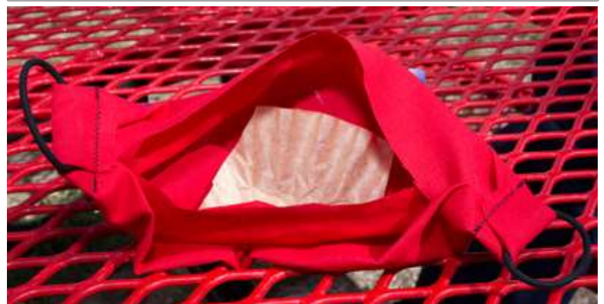
The protective masks that Lt. Brandon Roschewski makes for Dugway Proving Ground First Responders include a pocket for a coffee filter for extra filtration. The masks are washable and reusable, but the filter requires changing.

Even though the doors of our chapel building are closed, the Church has never been more open. I look forward to seeing you at chapel... virtually.