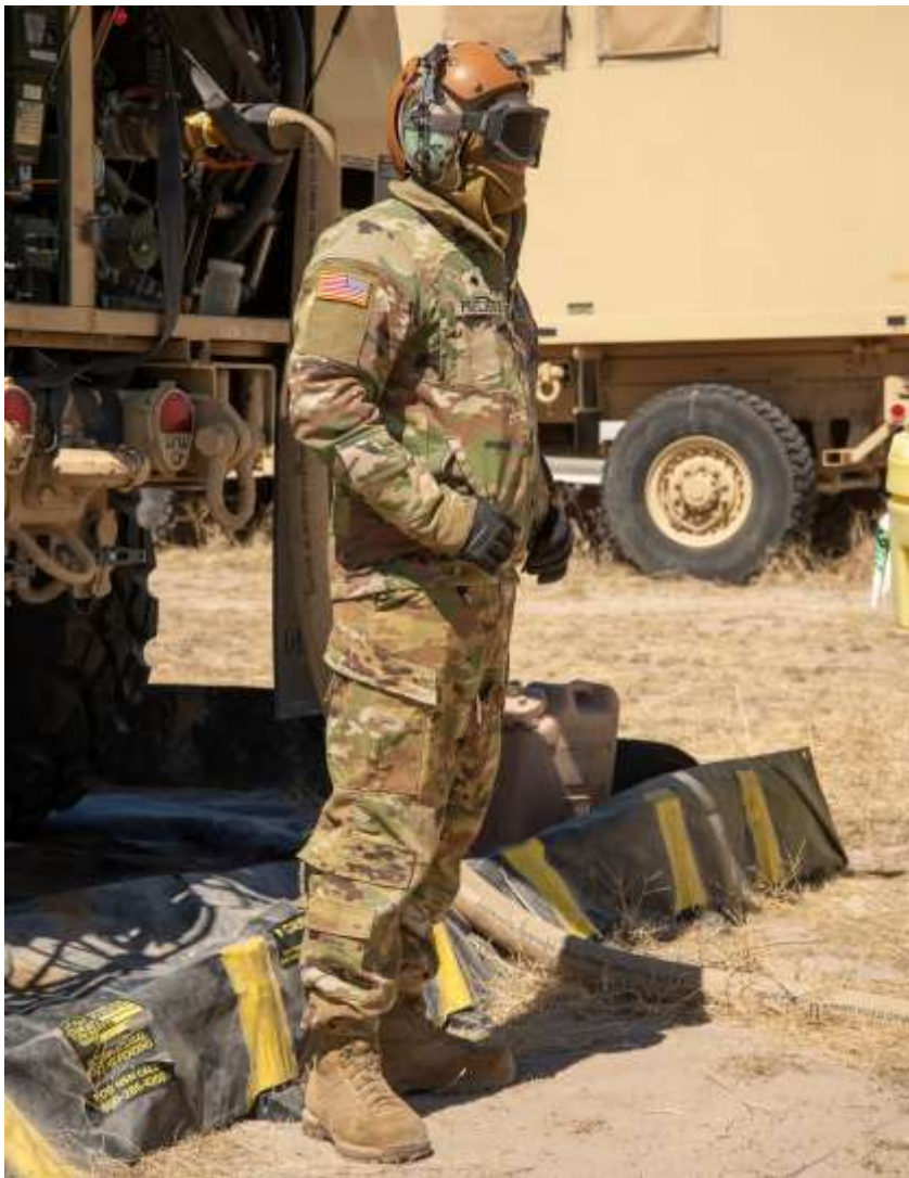
Continued from page 1.

equipment needed for the test must be present. (3) The customer must approve of how the test will be executed while operating under COVID-19 restrictions.