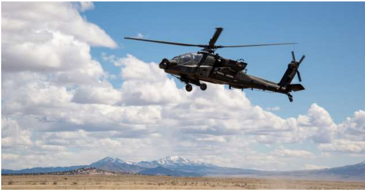
The Utah National Guard 1st Battalion, 211th Aviation Regiment, recently practiced aerial gunnery skills at Dugway Proving Ground. The installation's large size, restricted airspace, and remote location make it ideal for military training, testing and evaluation.