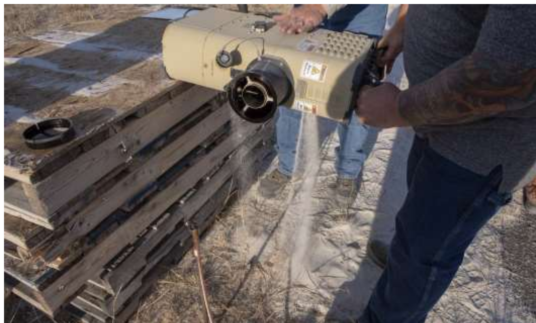
Technicians pour sand out of the SOM unit after the sand blowing test.

"It's been a fulfilling opportunity to test the SOM here at Dugway Proving Ground," shared Capp.