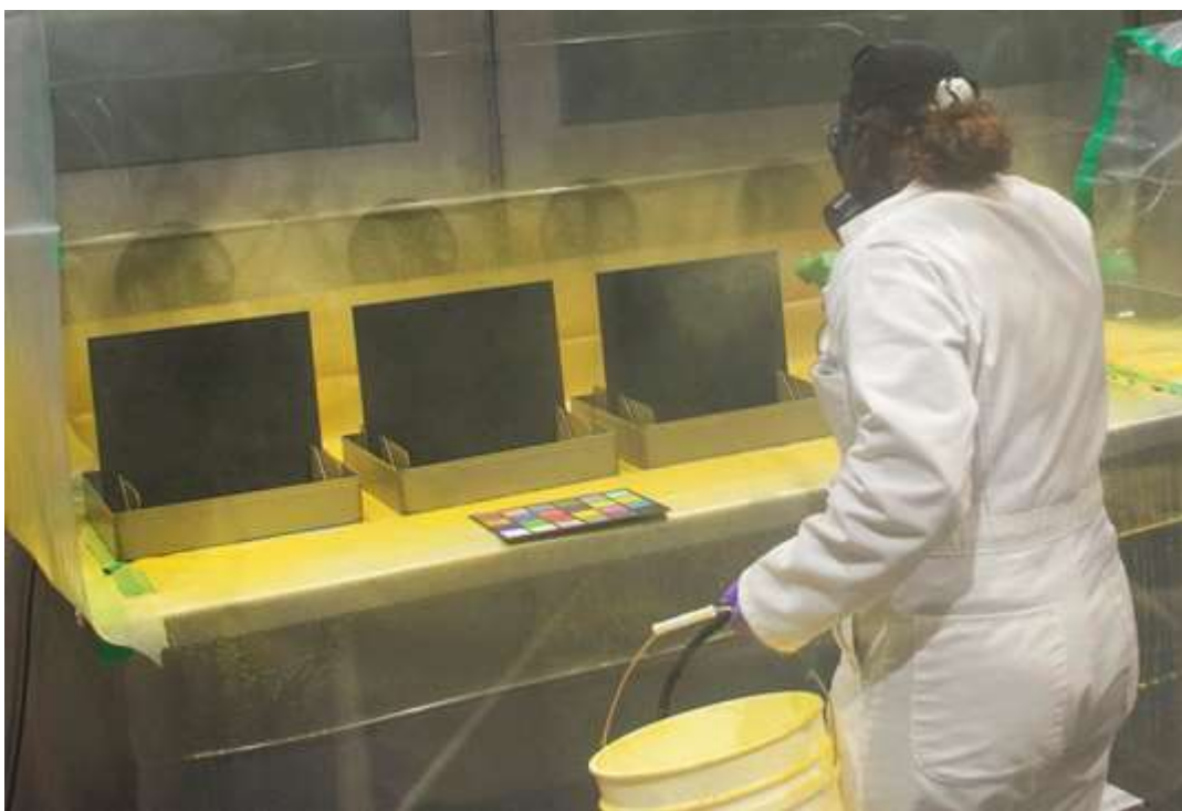
A panel is sprayed with the portable applicator to reveal the presence of agent (diluted for this test). CIDAS was created to indicate the type of chemical agent or decontaminant when sprayed on a hard surface.