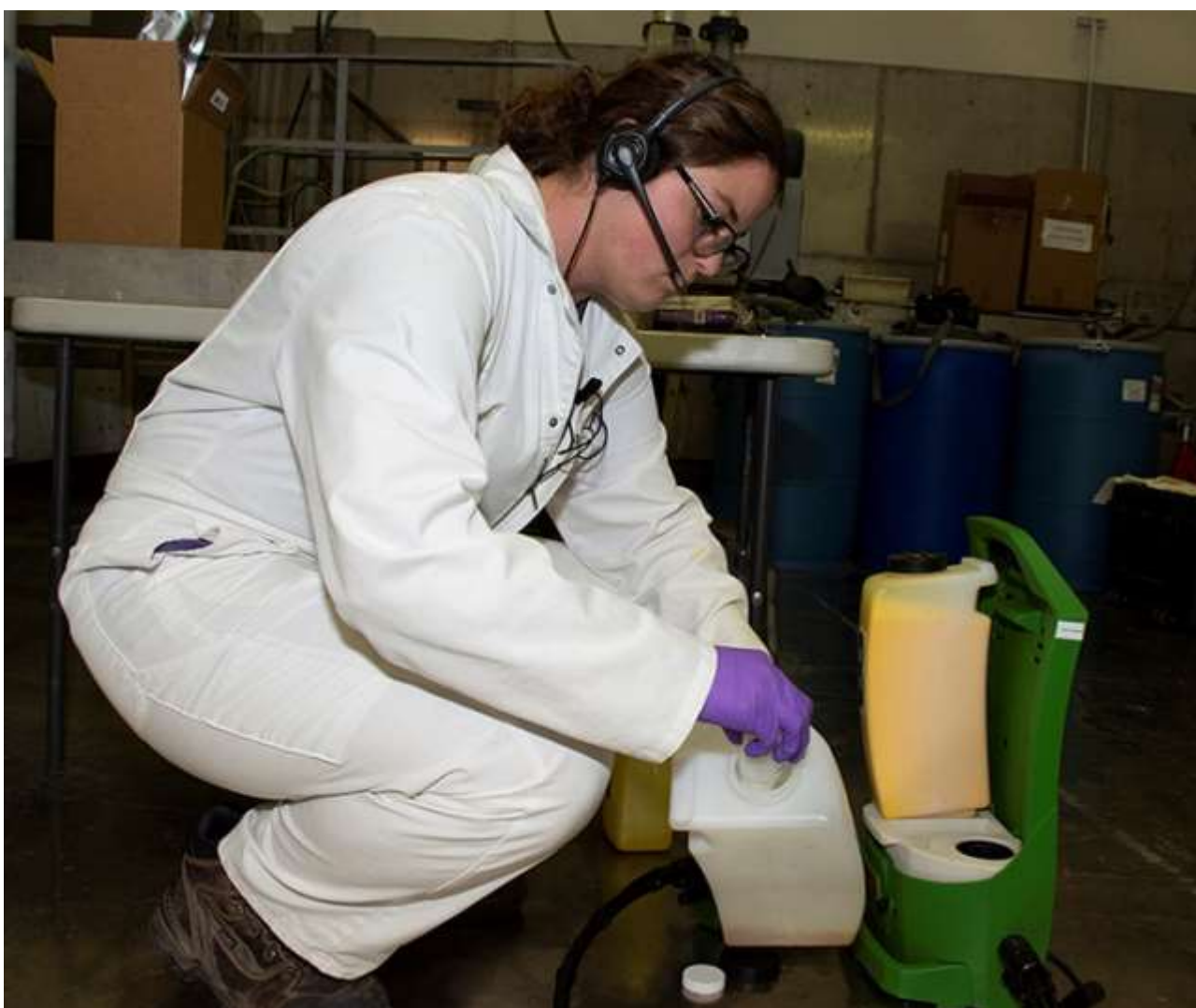
A tester fills each of the CIDAS applicator's two tanks with powder, then adds water and mixes well. When sprayed, the two liquids mix to reveal a chemical agent or decontaminant on a hard surface. CIDAS (Contamination Indicator Decontamination Assurance System) undergoing a large panel study at Dugway Proving Ground.