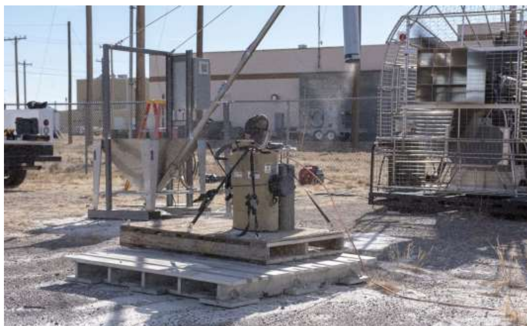
Sand is blown at a Screening Obscuration Module (SOM) for 30 minutes on each side as part of the sand blowing test at the West Desert Test Center (WDTC), Dugway Proving Ground.