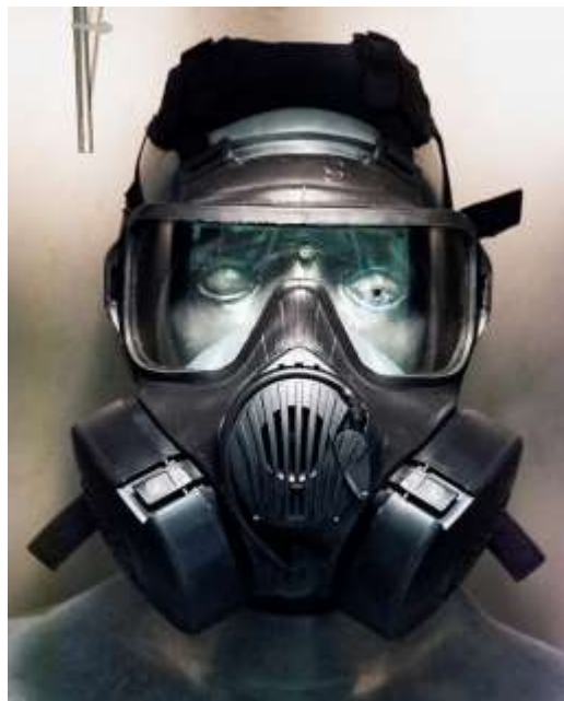
An M50 protective mask is affixed to a SMARTMAN (Simulant Agent Resistance Test Manikin) in a small testing chamber. The test was conducted to learn whether a relatively new decontaminant would degrade the mask.

To test the M50's exposure to the considered decontaminant with authenticity, Dugway uses the Simulant Agent Resistance Test Manikin (SMARTMAN) test fixture. A replicated