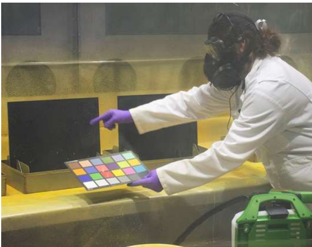
A tester points to the reaction left on the panel, indicating that agent was not fully decontaminated. The color of the agent is compared to the color panel, to indicate its type.

Testing of the CIDAS at Dugway proving Ground will ensure that the system functions as intended, with a high degree of reliability, to reveal chemical agent contamination to American and allied Warfighters.