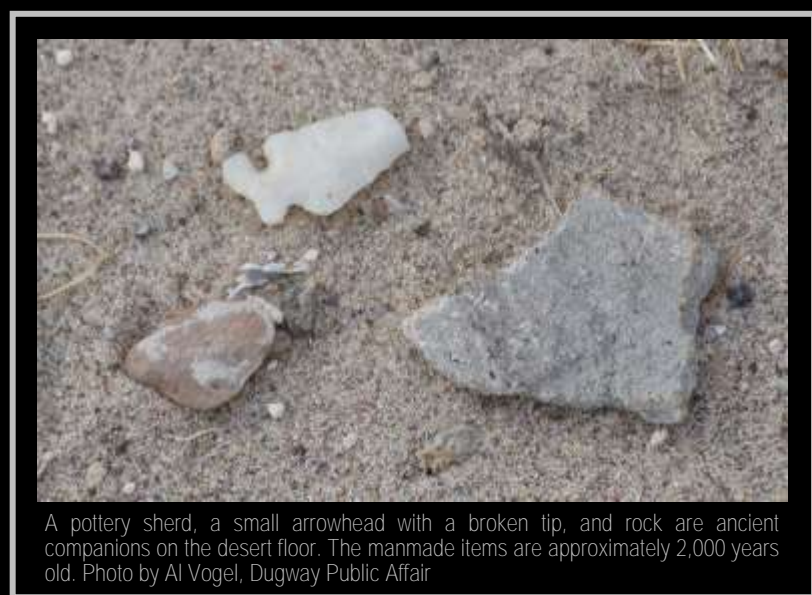
A pottery sherd, a small arrowhead with a broken tip, and rock are ancient companions on the desert floor. The manmade items are approximately 2,000 years old.