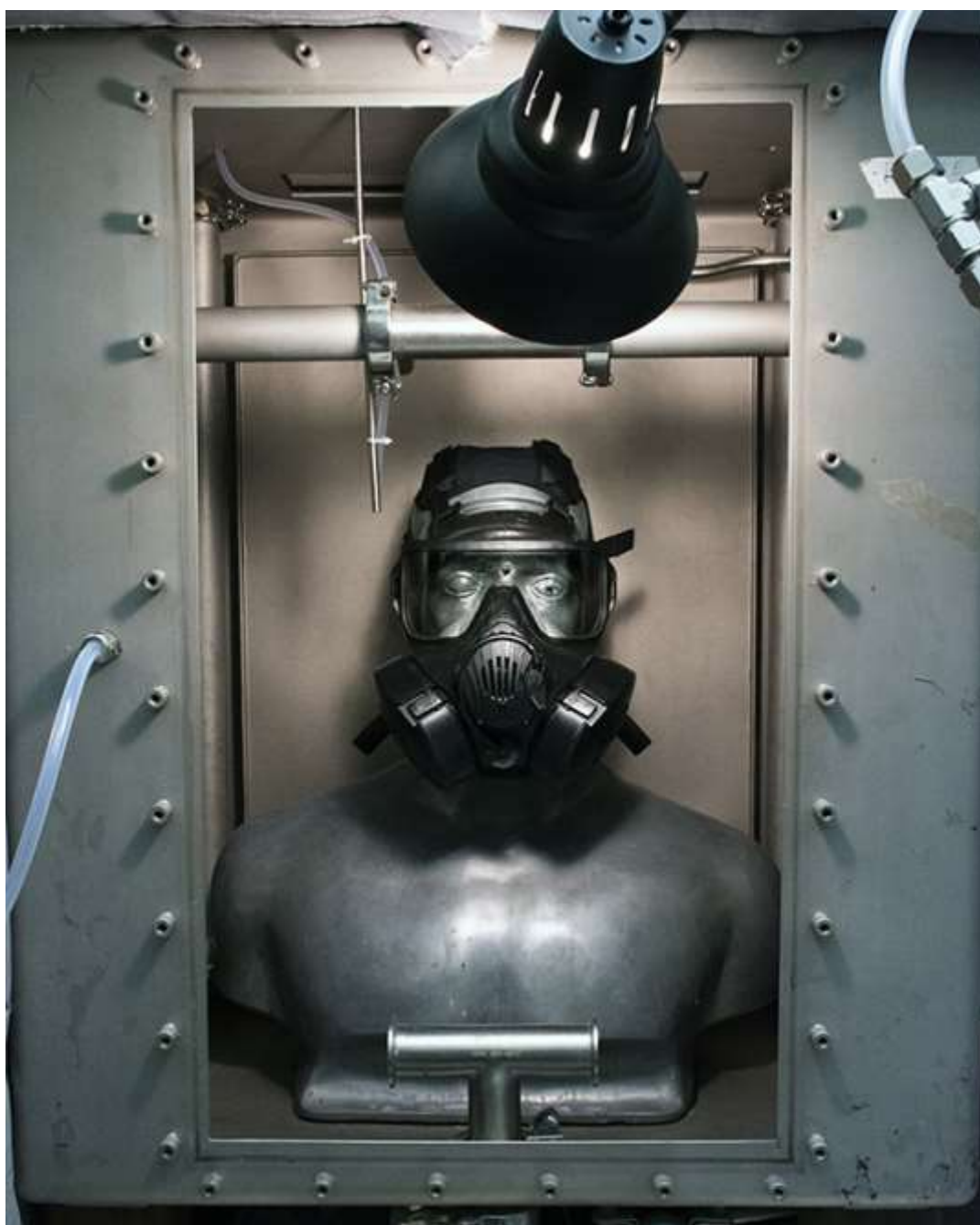
An M50 protective mask is affixed to SMARTMAN (Simulant Agent Resistance Test Manikin) prior to challenging then mask with Joint General Purpose Decontaminant for Hardened Military Equipment (JGPD HME).

Using SMARTMAN, a crucial test fixture at Dugway for decades, realistic challenge of the M50 gas mask will help protect American Warfighters and their allies should JGPD-HME become a widely distributed decontaminant.