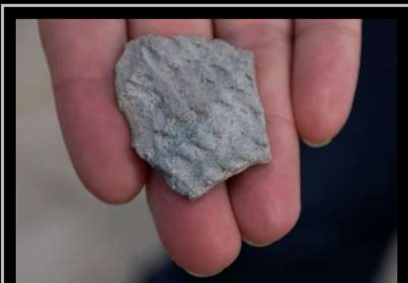
This 2,000-year-old sherd of pottery is distinctive for the wavy lines on its exterior; other sherds have different patterns. This may indicate each group of women that made pottery had its distinctive mark, rather like an ancient trademark. Five archaeologists from the Cultural Resources Office led the tour.

ers 2,000 years into the past at two Native American sites. The tour was conducted to recognize November as being Native American Heritage Month.