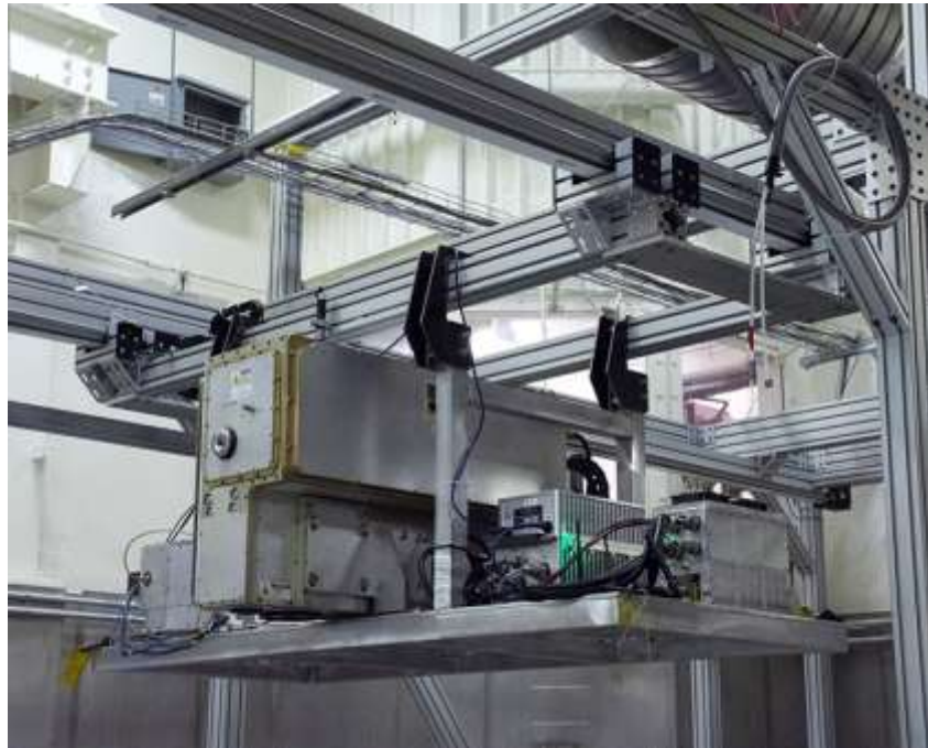
The detector rides on an overhead track, replicating its use on reconnaissance vehicle, and is challenged to visually detect chemical agent on dirt, concrete, asphalt and other sample surfaces inside the 30-foot chamber. Rectangular openings in the top of the chamber allow the detector to view directly below, without interference from plastic or glass walls. Chemical agent is kept from escaping the chamber by strong air suction and filtration.

eight-wheeled armored vehicle. The improved vehicle has more capability than the preceding Stryker NBCRV initially tested in the early 2000s at Dugway Proving Ground.