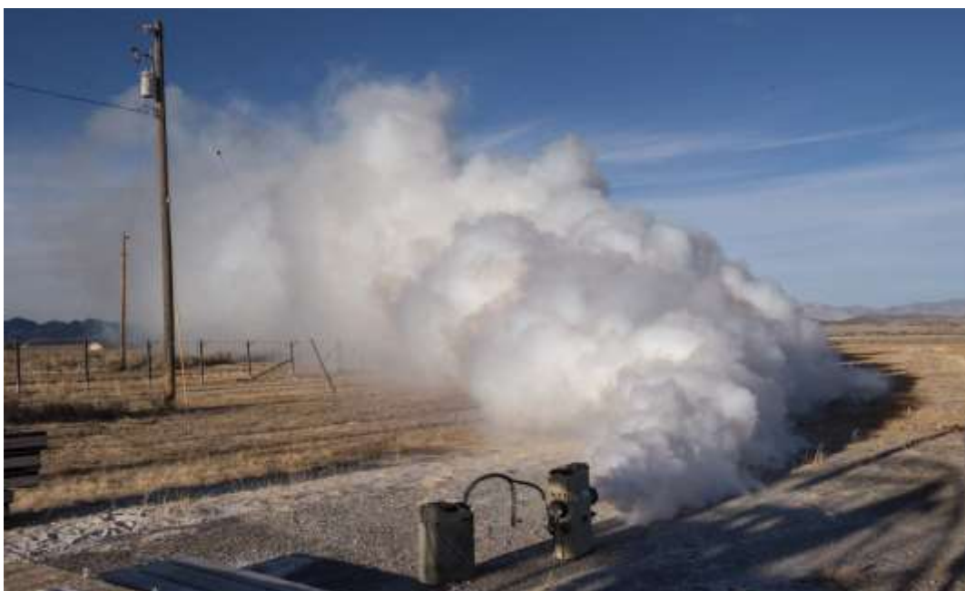
After the sand is poured out of the SOM unit, technicians start it up and let it run for several minutes to verify it works after being exposed to harsh conditions such as a simulated sand storm.