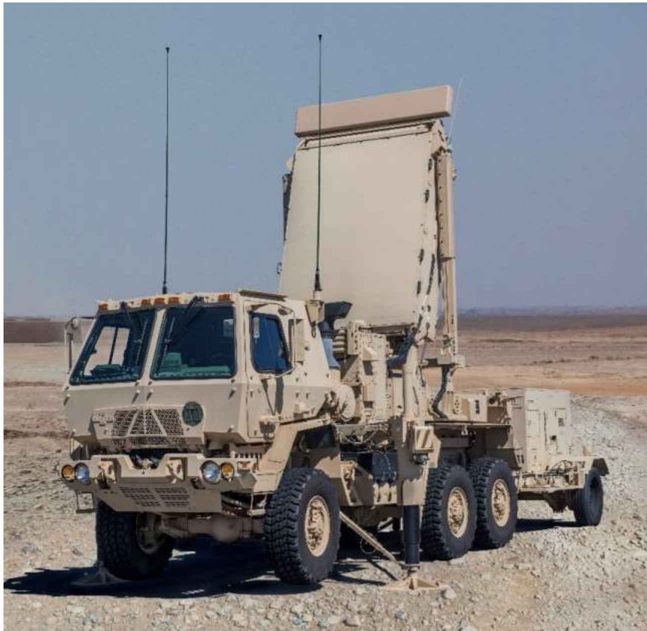
An AN/TPO-53 Radar, scanning for projectiles during the Early Warning Enhanced Capability data collection conducted October, 2018 at Dugway Proving Ground, Utah. Originally designed to locate the firing positions of mortars and rockets, the radar was challenged to collect flight characteristics of various 155mm projectiles, including simulated chemical rounds.