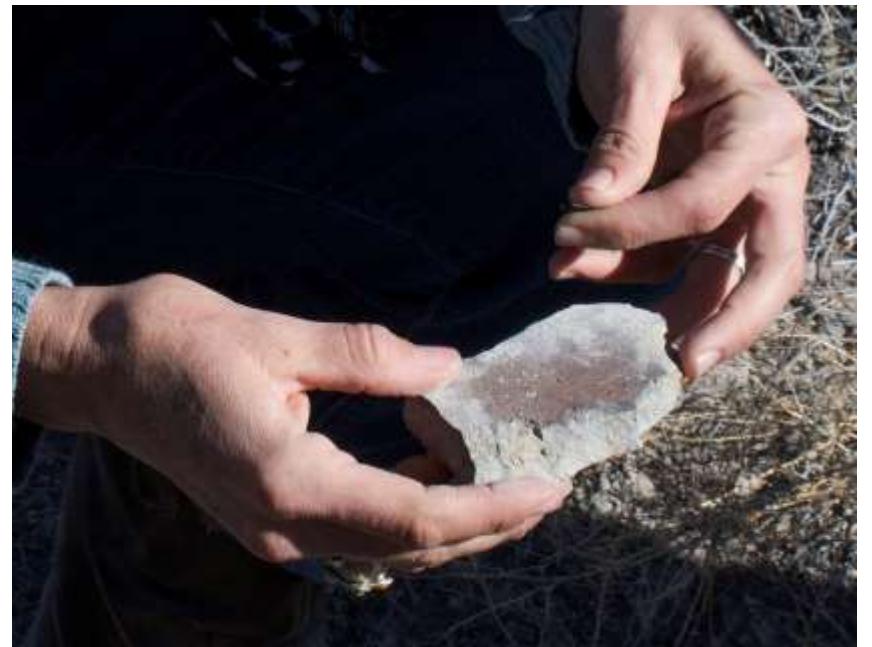
A stone with one side worn flat found during a cultural resources survey at Dugway Proving Ground, Utah. Photo taken during the Nov. 6, 2018 Native American Indian Heritage Month Observance field trip and archaeological visit to a site approximately 2,000 years old.

Returning on the bus in the afternoon, numerous workers ad-