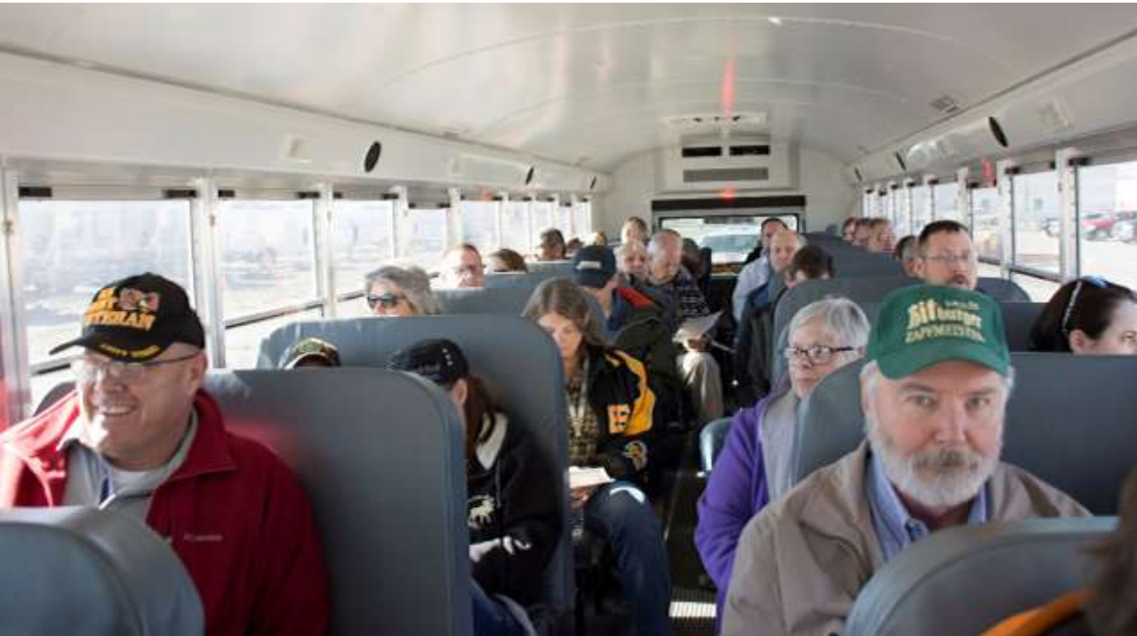
The bus at Dugway Proving Ground was full during the Native American Indian Heritage Month Observance field trip and archaeological site visit Nov. 6, 2018. Dugway archaeologists took Soldiers and civilians on a short, walking tour of multiple sites up to 2,000 years old to appreciate the history of Indians in the area.