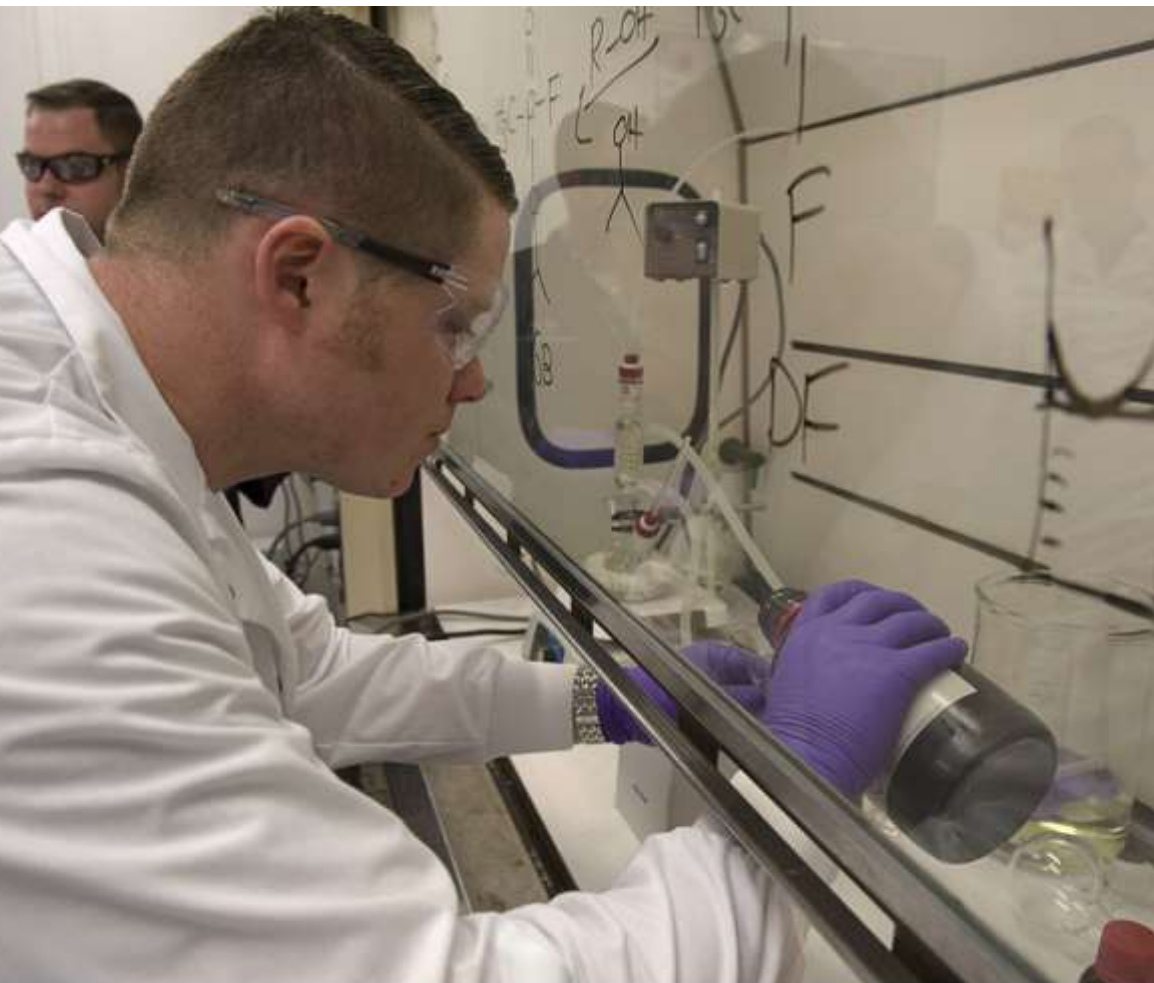
A German Bundeswehr soldier from the CBRN (Chemical Biological Radiological Nuclear) Defence Battalion 750 measures a liquid in a protective hood, during February 2017 training at Dugway Proving Ground, Utah. More of Germany's soldiers specially trained in CBRN defense are expected to train at Dugway in the coming years, per a recent arrangement.