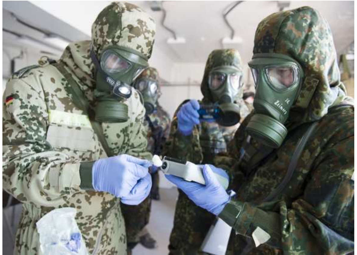
German Bundeswehr soldiers from the CBRN (Chemical Biological Radiological Nuclear) Defence Battalion 750 use a chemical agent detector to identify a simulated chemical weapon agent in a mock illicit lab at Dugway Proving Ground, Utah. Dugway recently agreed to train Germany's specialized chemical and biological defense troops in the years ahead.