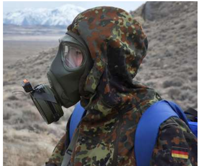
A soldier of the German Bundeswehr stands guard at Dugway Proving Ground, Utah, while other specially trained German soldiers search out and sample replicated biological labs during an exercise. The nation's premiere center for testing defenses against biological and chemical weapons, Dugway plans to train the Bundeswehr soldiers at least annually.