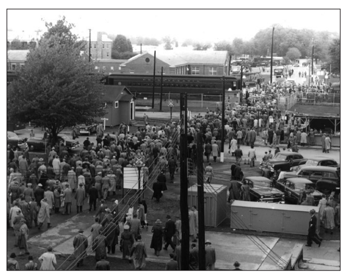
Workers end the day by boarding waiting Pennsylvania Rail Road passenger cars outside of the main front for their commute home.