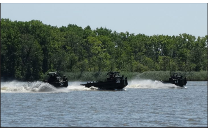
BEBs perform reliability testing in the Spesutie Narrows.

After production qualification testing will come a logistics demonstration and limited user test performed by active-duty Soldiers.