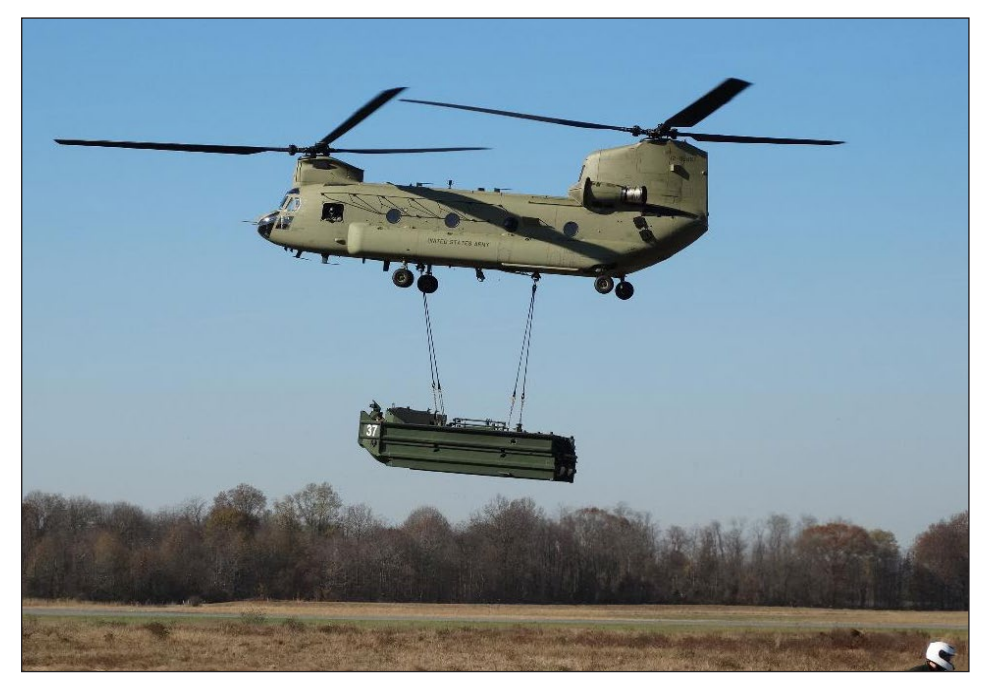
A CH-47 helicopter flies the BEB as a sling load.