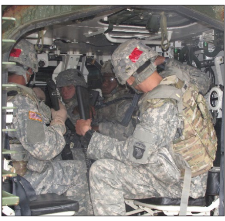
Soldiers performing vehicle ingress and compatibility trials.

Since 2013, ISSB has supported Soldier performance and user assessment testing of the Soldier Protection System, including the Modular Scalable Vest, Ballistic Combat Shirt, Integrated Head Protection System, Integrated Soldier