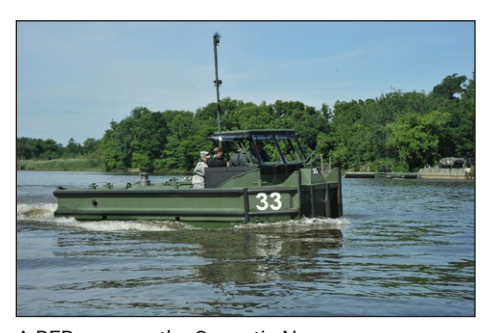
A BEB crosses the Spesutie Narrows.

The XM 30 BEB had unique design requirements; perhaps the most paramount consideration was the need for it to interface with previously