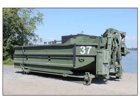
The BEB, loaded on a bridge adapter pallet.

Wet-gap bridging, the crossing of a body of water with vehicles or personnel, is not a high-profile commodity in the military community. However, its importance is not lost on Product Manager Bridging, the division of U.S. Army