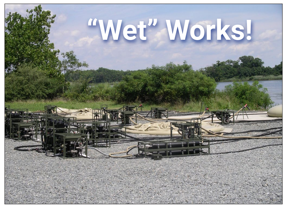
USMC Lightweight Water Purification System testing at Petroleum and Water Systems site.