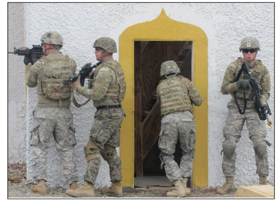
Each Soldier is wearing a modular scalable vest while performing an urban terrain mission.

Soldier assessments consist of individual anthropometric measurements, timed don/doff trials, obstacle course maneuvers, tactical equipment compatibility trials, vehicle ingress/egress, range of motion measurements and functional movement screening. Tactical field events include weapons live fire, foot marches, land