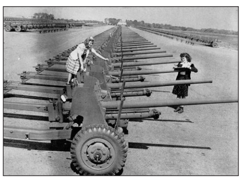
After acceptance tests, numbers are verified on antitank guns. During the war women took on many jobs once reserved for men.

The December 7, 1941, attack on Pearl Harbor hurled the United States into war with Japan, and soon we were embroiled in the war in Europe as well. This heralded the expansion of the U.S. Armed Forces, which created an even more urgent need for increased activity at APG. Almost overnight, war production increased dramatically. This meant not only heightened testing, but also rapid expansion of APG. The U.S. Government purchased 7,000 more acres of land, extending APG to the Aberdeen town limits. Spesutie Island was leased for use, and purchased in 1945, from the estate of J.P. Morgan.