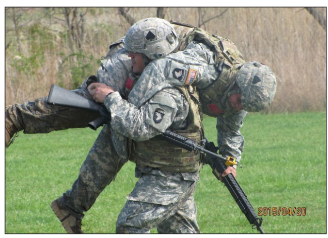
Simulated injured Soldier carry.

navigation and urban terrain engagements. Throughout all testing, the Soldiers complete surveys to provide their subjective opinions about comfort, compatibility and performance of the systems. They also complete electronic surveys at the end of all testing, and After Action Reviews are held to expand