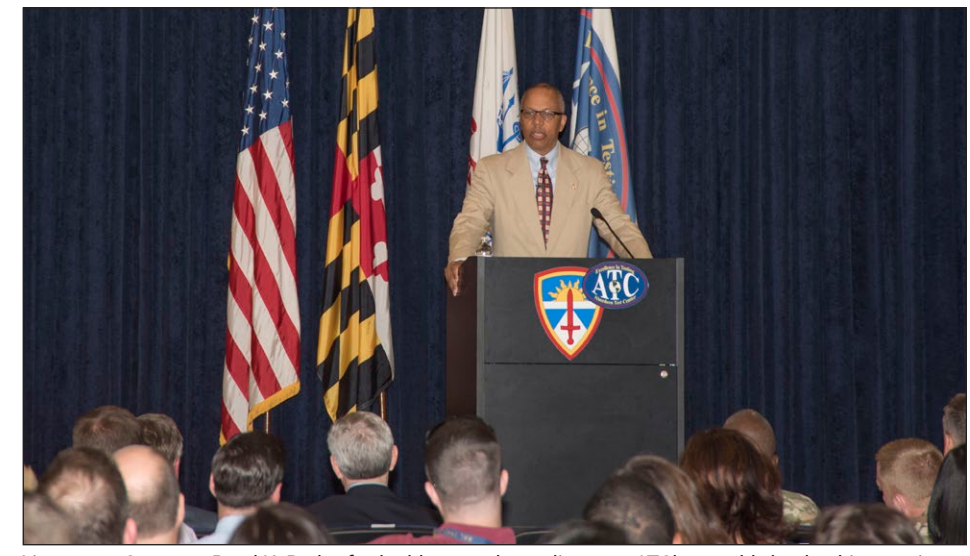
Lieutenant Governor Boyd K. Rutherford addresses the audience at ATC's monthly leadership meeting.