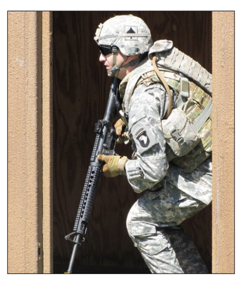
Individual protective equipment is the Soldier's first line of defense.

and augment data findings from the field. The surveys and reviews address critical system design and performance requirements and aid in the selection and fielding of life-saving equipment for military personnel. ATC specializes in test technology that provides scientific, comprehensive data on Soldier as a System performance in a dynamic environment.