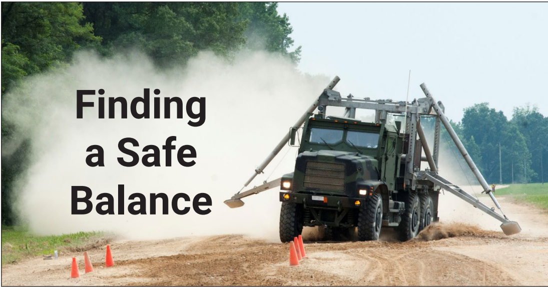
A Medium Tactical Vehicle Replacement (MTVR) performs a NATO double lane change at the Perryman Test Area A course.