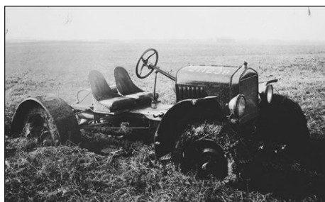
Ford Reconnaissance Car stalled during a test, December 28, 1923.

Ordnance testing of artillery and ammunition persisted, and it was during this interwar time period that the test mission of the Proof Department expanded to include automotive testing. Vehicles such as the Ford 6-ton tank, the Class B Liberty truck, and various predecessors of the World War II Jeep were tested at the Proving Ground. Construction began on an automotive test course in 1933, and vehicles