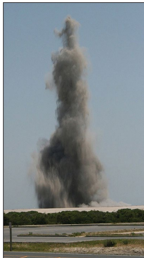
ATC's explosive ordnance disposal team detonates a World War II bomb off the shore of Assateague Island.

identified hundreds of locations within formerly used defense sites that contain discarded military munitions and unexploded