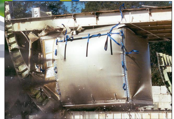
Blast-resistant baggage/cargo container design test in process.

The central issue is determining the minimal size threshold for an explosive to cause immediate catastrophic aircraft loss. The test data is used to establish performance standards for the screening technologies used in airport checkpoints, upgrade future aircraft design, and develop technologies to reduce aircraft vulnerability to explosives. These improvements help to ensure that potentially disastrous terrorist acts do not result in the loss of the aircraft.