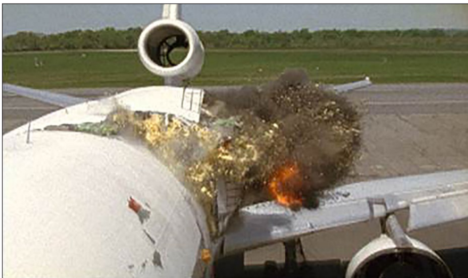
DC-10 jet airliner undergoing vulnerability testing at ATC's Phillips Army Airfield.

ATC also supports basic research on various types of explosives, both standard and homemade. As a Major Range and Test Facility Base, ATC provides the DHS Science and Technology Directorate with the scientific, engineering and test resources and capabilities of the DOD. Through their collaborative effort with ATC, DHS can leverage existing resources to innovate the technological tools to protect the homeland.