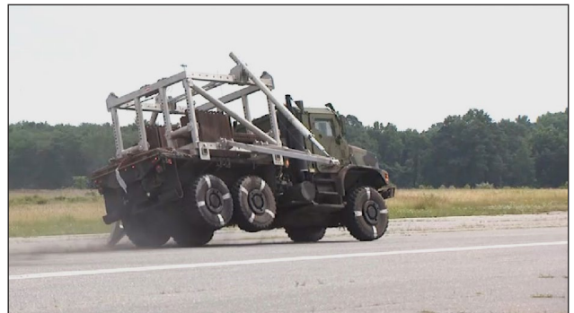
An MTVR with outriggers undergoes a sine-with-dwell test at Phillips Army Airfield.

After a vehicle is tested in various configurations, the pertinent data is forwarded to evaluators and program managers to facilitate decisions on