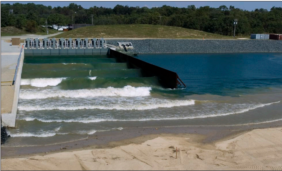
The Littoral Warfare Environment can generate wave action that accurately mimics surf conditions.

shear stress, turbulence and surge) on munitions movement (burial, exposure, transport) on the beach face—the sloped portion exposed to the swash of waves.